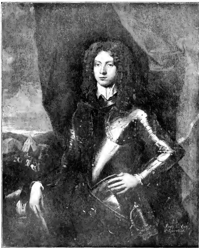
HENRY, FIRST EARL OF SUNDERLAND.